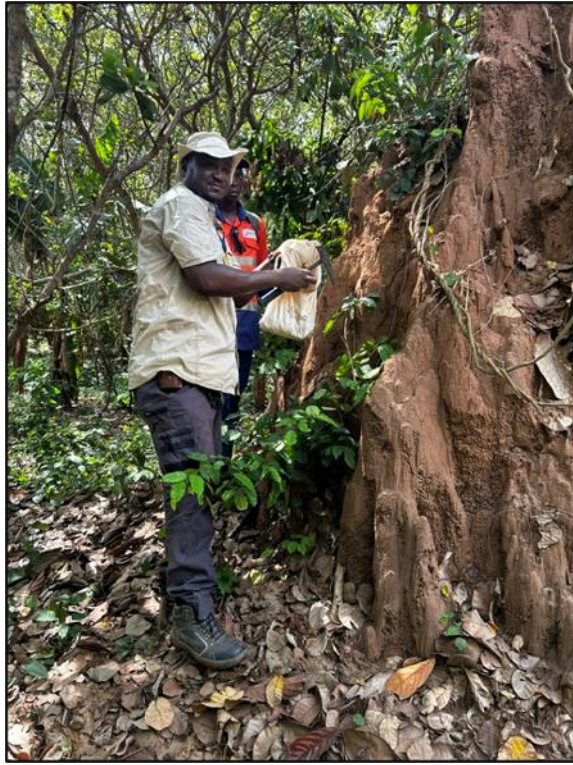
Image 1. Sampling of Termite Mounds at Fifty-Five Prospect