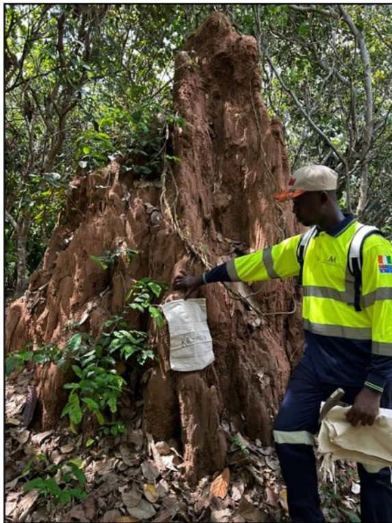
Image 2. Sampling of Termite Mounds at Fifty-Five Prospect